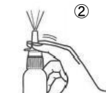
Hold the container and press the nozzle 2 to 3 times until the liquid is sprayed out.