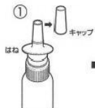
Please remove the cap.